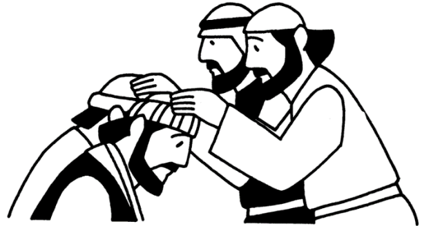
From The Complete Bible Story Clip Art Book . ©Gospel Light. Used by permission.

Find the words or pictures below that are part of this service. Circle them. Circle more times for words or actions we use or do more than once!