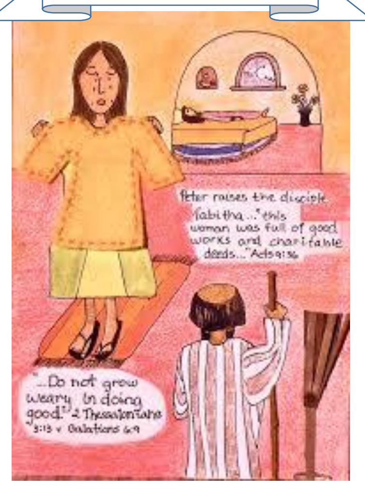
St Luke's Anglican Church, Anglican Network in Canada

God is good Jesus is Lord Holy Spirit helping us, we'll love God and each other and tell the world!